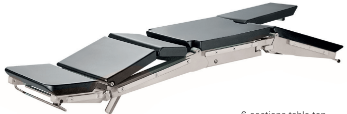
6-sections table top