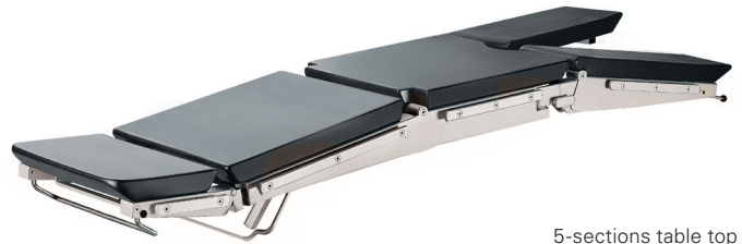
5-sections table top